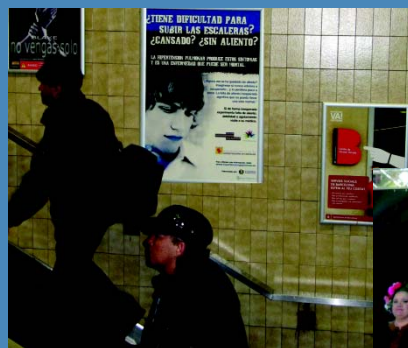
Spain, posters in metro stations