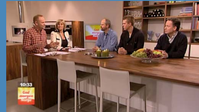
PHA Norway President on popular TV talk show