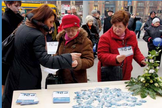
Poland, distributing materials