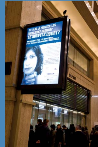
Gare Centrale, Brussels