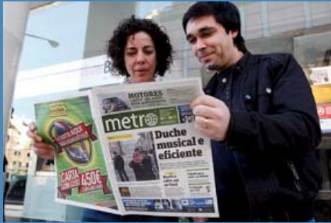
Ads in Metro journal, Portugal