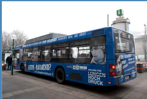
"Branded" bus, Austria