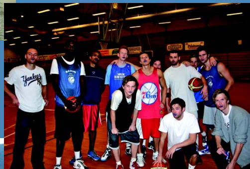
Norway, top league basketball team playing with blue lipstick