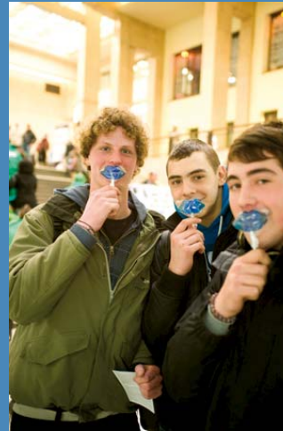
Blue lip lollipops