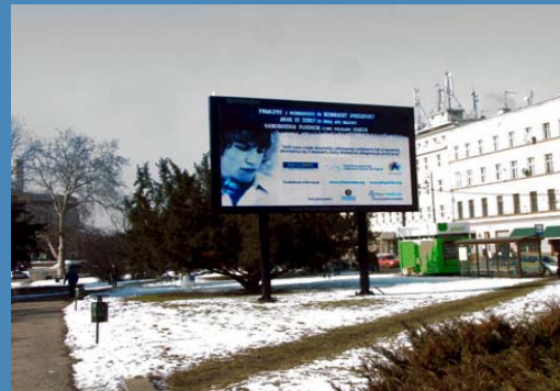
Poland, large outdoors ads