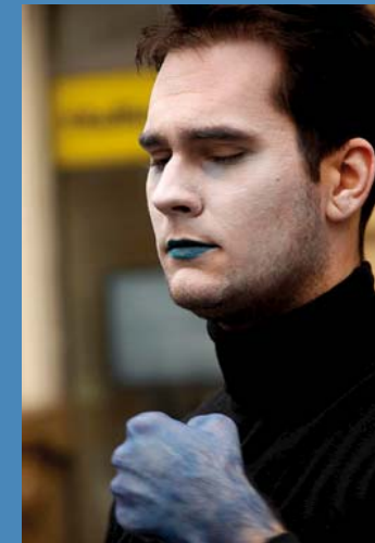
Hungary, miming the Breathing message