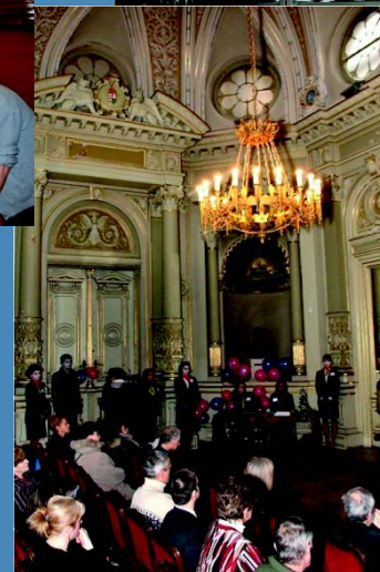
Hungary, press conference